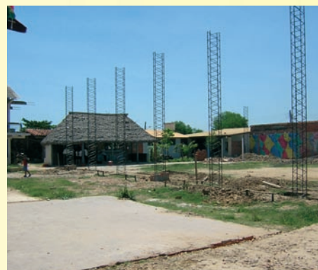
The first columns for the new meeting hall are erected